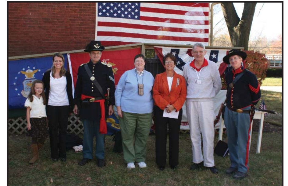
Members of the Historical Society at the Cumberland Cemetery Veterans' Day Festivities.